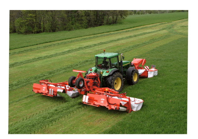
Typical uses for Bucher Hydraulics' hydraulic control blocks include hay turners and rakes, seed drills, and mowers.