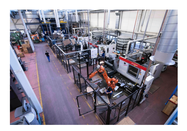
The highly automated production with cutting edge 5-axis machining centers is located in-house at Bucher Hydraulics.