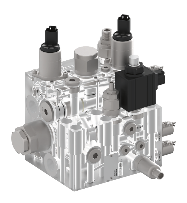
Bucher Hydraulics' control blocks stand out for their compactness, light weight, and high energy efficiency. Behind them lies a wealth of expertise not only about the product but also its application and manufacturing technique.