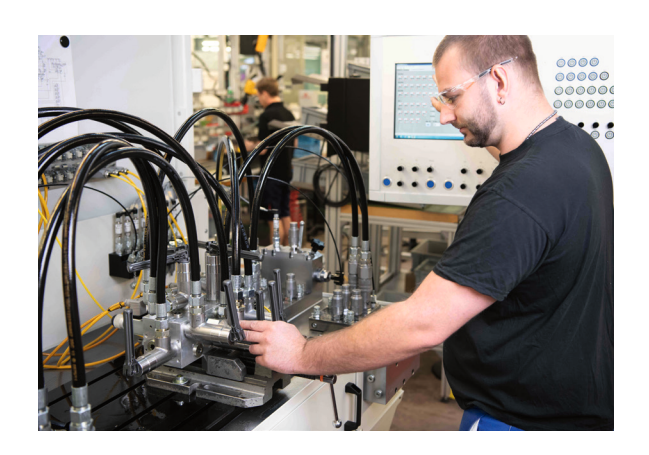
The test benches at Bucher Hydraulics are developed by a separate, specialized department.